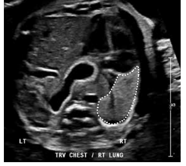
LCDH, AP Method for LHR