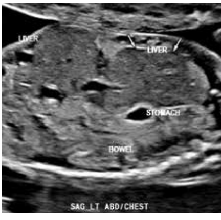
Lt CDH, liver up, using high-resolution gray-scale to demonstrate liver position