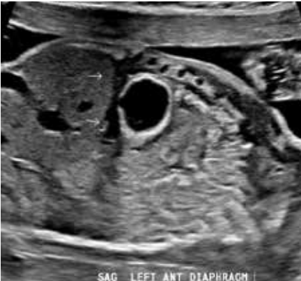
Lt CDH, liver down, using high-resolution gray-scale to demonstrate liver position