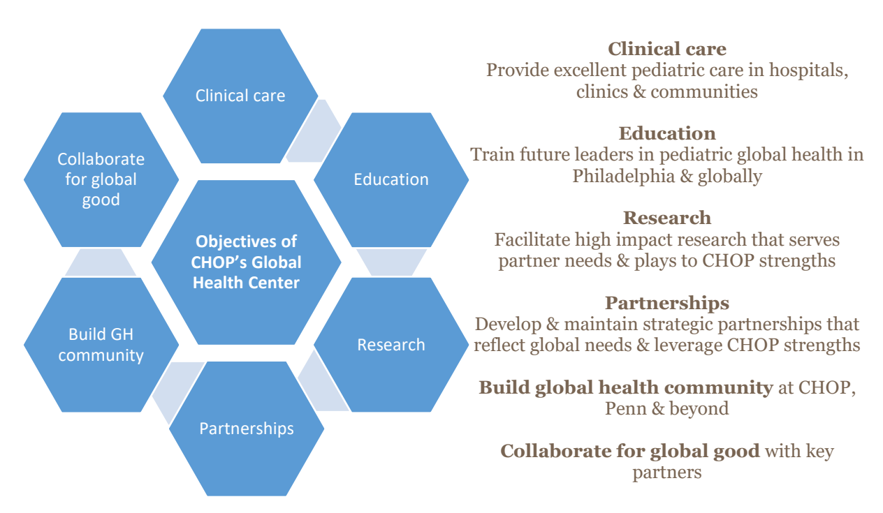
Figure 1: The six objectives of CHOP's Global Health Center

Global Health has been practiced for decades at CHOP, and, since 2004, the scope of global health activities has grown considerably. CHOP's Global Health partnerships include long-term pediatric programs in the Dominican Republic and Botswana, which aim to improve the health of children and families as well as build capacity among local healthcare providers in five areas: clinical care, teaching, research, leadership and advocacy. Beyond Botswana and the Dominican Republic, CHOP physicians and staff also have active collaborations in more than 20 other countries around the world.